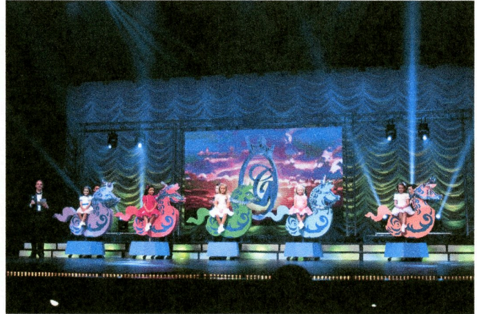
International Pageant Top 5 Tots in Tot Personality

their name, age and hometown. The Emcee will then ask her a few questions relating to the information provided on her Entry Form. This interview is designed to be brief but light-hearted and focuses on the communicative skills of the participant.